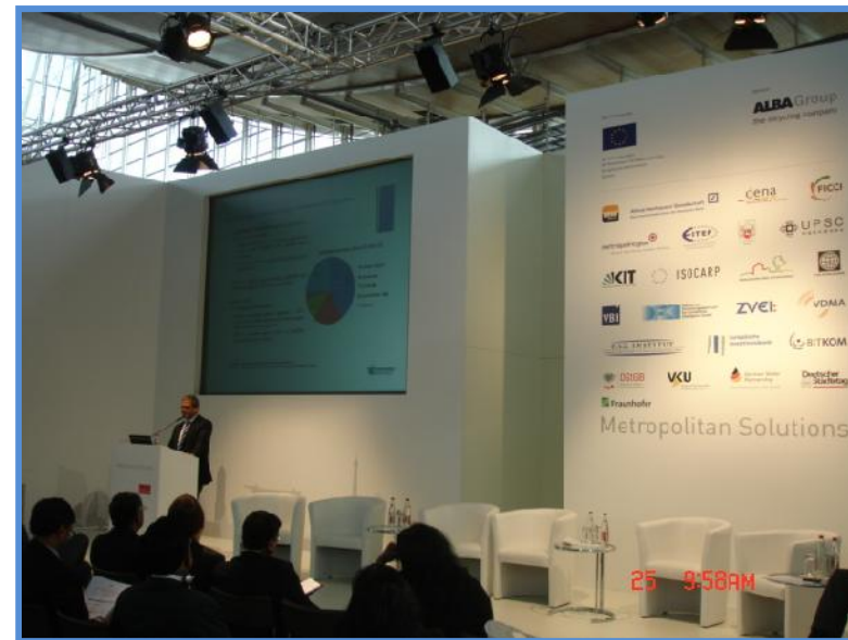
Honorable Shri Kamalnathji, Minister of Urban Development, Govt. of India at Hannover Messe